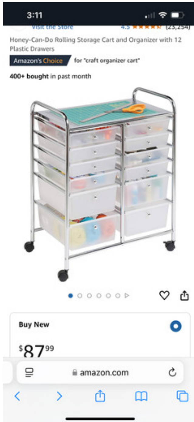
rolling cart for centers.jpeg